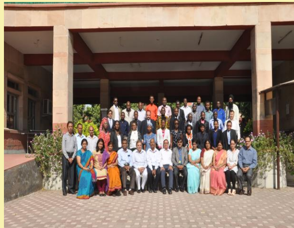
Participants of Monitoring & Evaluation with the Faculty (2016-17)