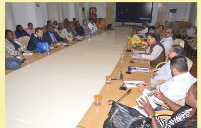
Participants interacting at NITI Aayog

The course besides teaching traditional M&E concepts and approaches, focuses upon new and emerging knowledge including impact evaluations, outcome mapping, strength-based approaches, social audits, etc.